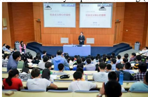
Figure 2 Stimulate students' interest in learning