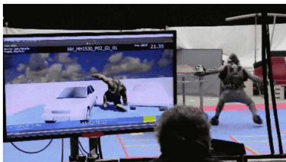
Figure 3 New theoretical results

In the 18th National Congress of the Party, it is pointed out : " it is necessary to build the contingent of teachers, improve the teaching level of teachers, and enhance the sense of responsibility of teachers' own teaching ". The school political teacher, as the indicator lamp on the way of students' study, should constantly improve their self-cultivation, strengthen the implementation and propaganda of the Party's principles and policies, and help students to establish a good outlook on life, values, and world outlook. Under the theory of coordination, the higher requirements for school political teachers are also put forward. Teachers are not only required to study scientific theories carefully, but also to focus on the publication of new theoretical results in real time (Fig .3).